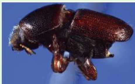
SMALLER EUROPEAN ELM BARK BEETLE