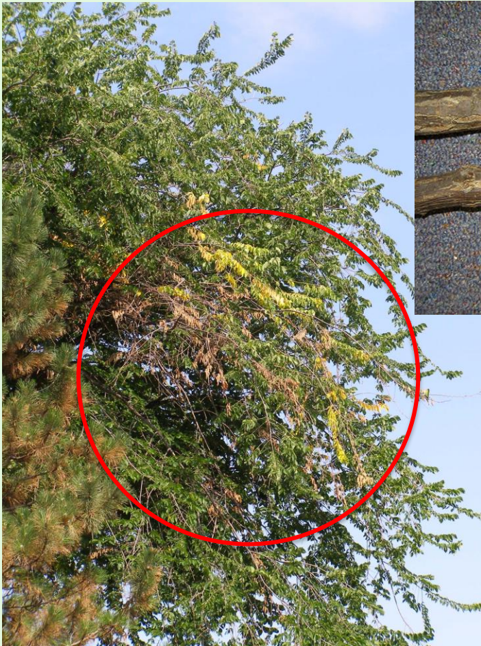
AN INFECTED TREE