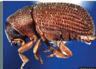
NATIVE ELM BARK BEETLE