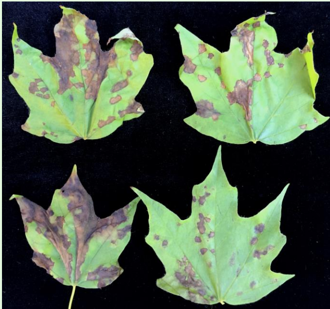
ANTHRACNOSE ON SUGAR MAPLE LEAVES

Pest: Several fungi including Aureobasidium apocryptum cause Anthracnose. Hosts include sugar, red, Norway, silver, and Japanese maples. Spores spread through splashing water and wind. The fungi can also overwinter in senescent leaf tissue on the ground and in infected twigs/buds.