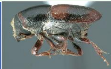
BRANDED ELM BARK BEETLE